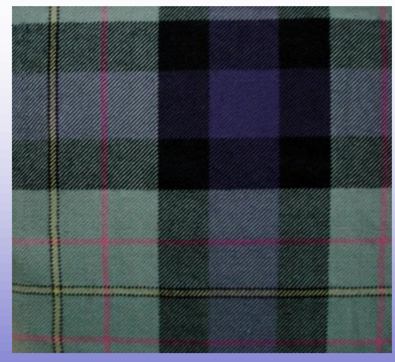
Ancient II (Purple)