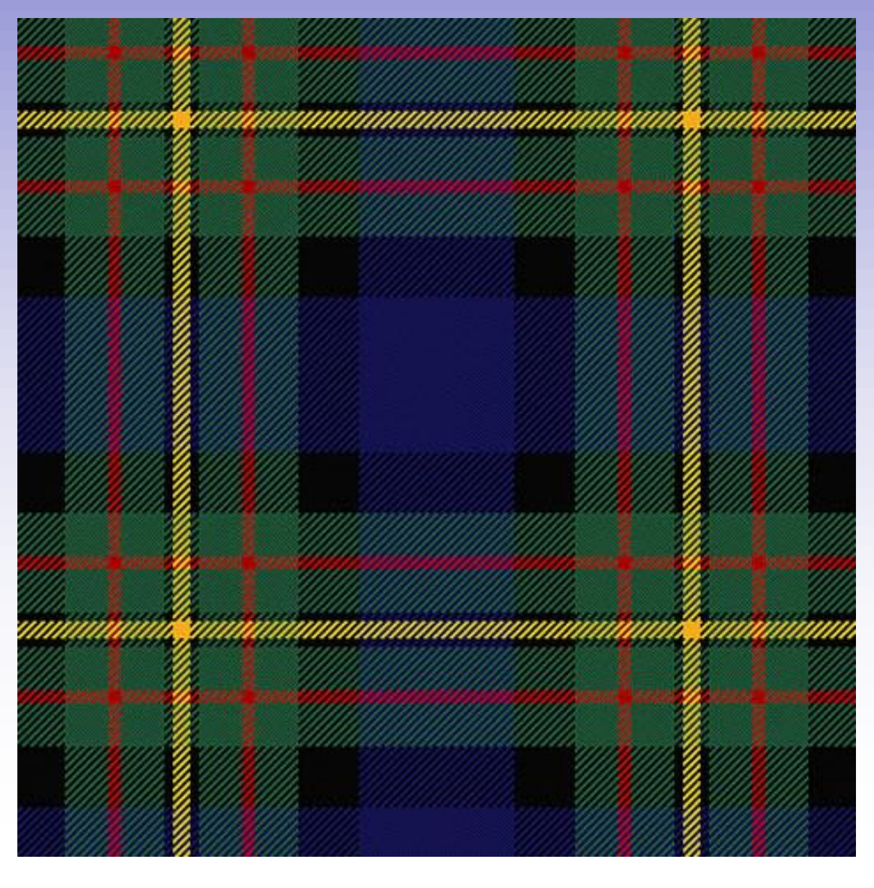
Modern (Dark Blue)