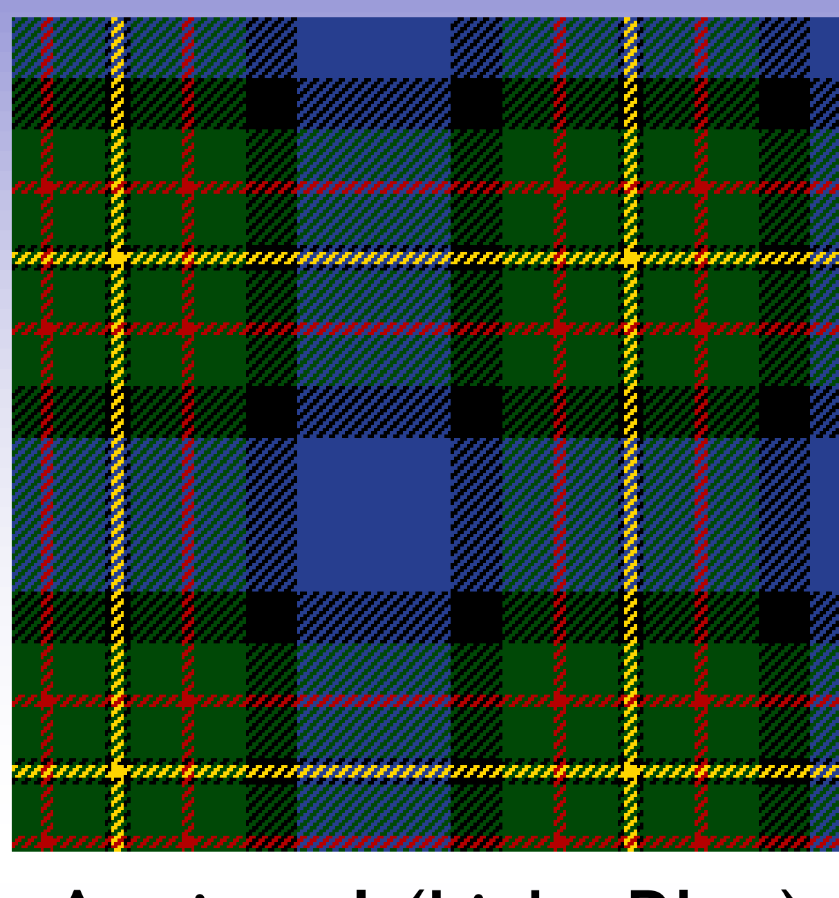
Ancient I (Light Blue)